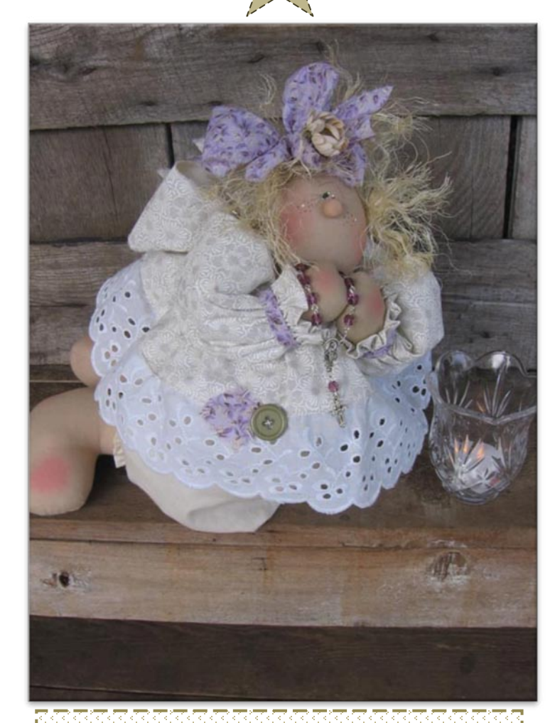
#165E 11" Blessed Sweet Pea