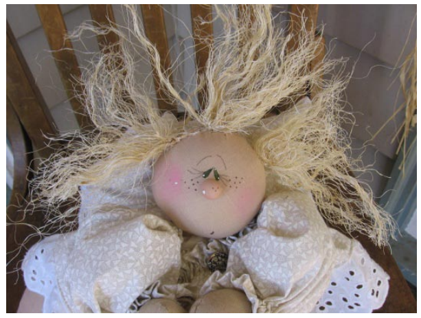
Hair and Hair bow

Take your rope and pull pieces apart...Make small clumps of hair and tie in middle like in photo. (I use a tiny piece of scrap hair to tie in middle)...Glue one group on top of hair in middle and one group at either side about 1" apart...Take your bow strip and starch and press...Cut in half and make two bows out of each strip...Glue both off to one side together to make a really full bow...Glue a silk flower in front of bow.