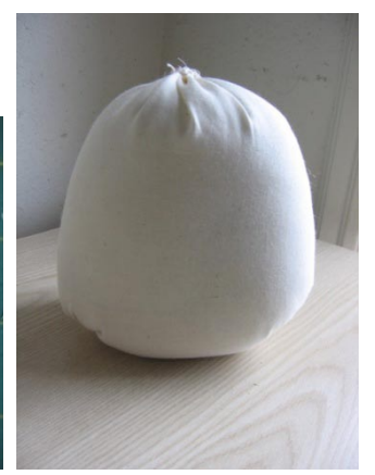
Turn and stuff very firm... Hand gather top closed.