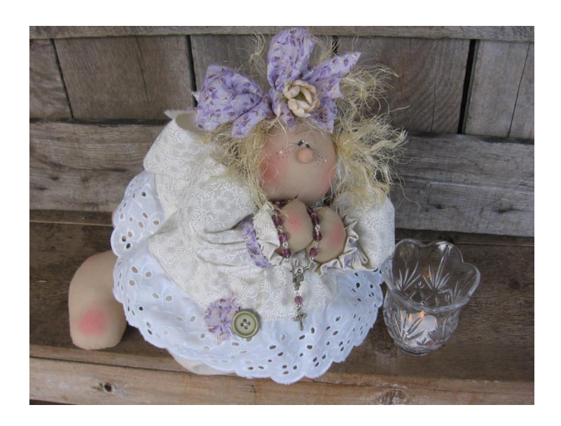
Blessed Sweet Pea

Directions for applying elastic...Fold and press under long edge of piece 1" ...Lay elastic close to raw edge on both layers...back stitch on beginning of elastic...holding onto fabric behind presser foot, pull the elastic and zig zag over the elastic to end of fabric (zig zagging over elastic is making a casing) ...Pull elastic to desired length... Back stitch across end.