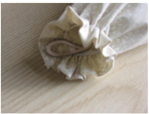
Sleeves and arm wire

Turn up bottom of sleeve 1" and apply elastic 1/8" from raw edge...Pull elastic at end until it measures 4 ½"...Sew across end of elastic...Turn and add a tiny amount of stuffing inside sleeve.... Cut your wire pieces and bend both ends of each into a loop...Insert one wire into each sleeve and push up to top of sleeve...With needle and crochet thread, whip stitch through fabric and loop on wire to secure it to the top of sleeve....The bottom loop should be secured at seam at bottom of sleeve. (photo's on page 6) Pull apron down and attach tops of sleeves